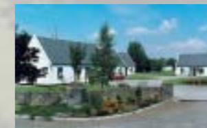
Award Winning Terryglass Village

Nenagh town is a short distance away with its Castle, Heritage Centre and varied selection of shops, pubs and restaurants.